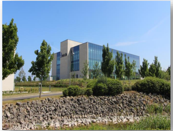
“IRISH LIFE” - DIRECTLY OPPOSITE