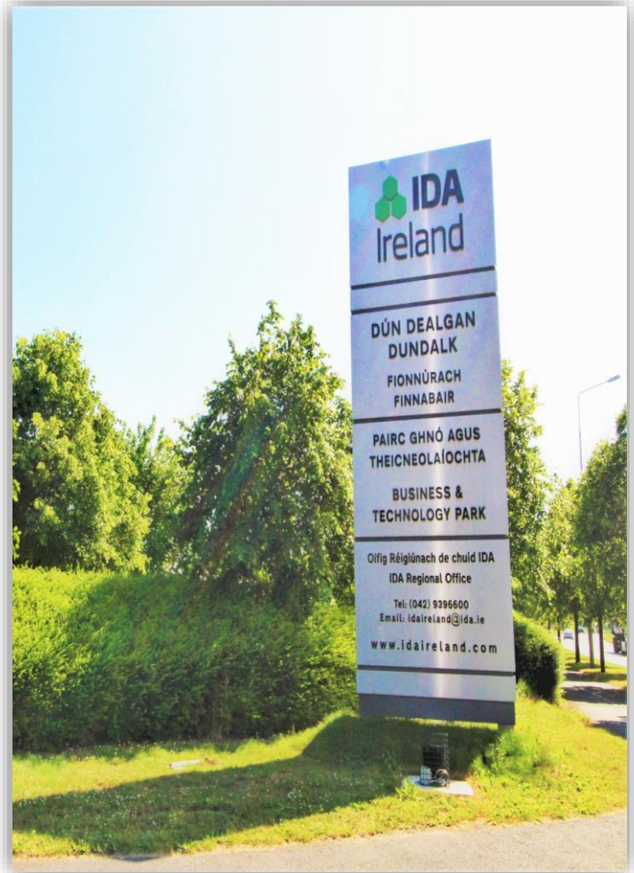
ACCESS TO PARK DIRECTLY OFF EASTERN BYPASS