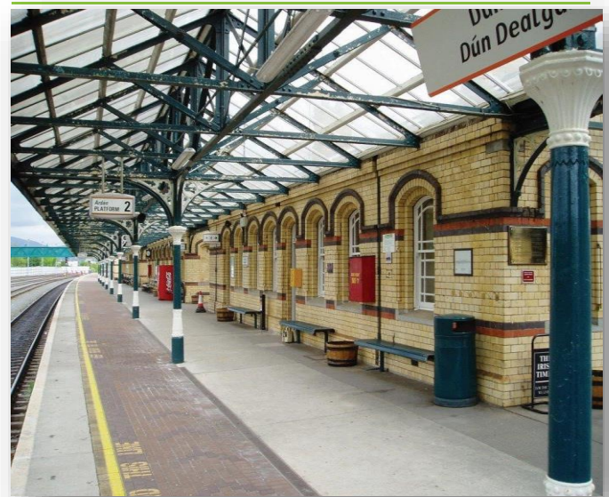
CLARKE STATION – REGULAR SERVICES

The “M1 Corridor” offers businesses unrivalled access to talent and infrastructure.